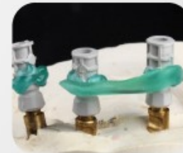
Associated use of gel and paste