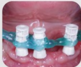
Union of transfers