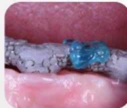
Temporary Splint for soldering